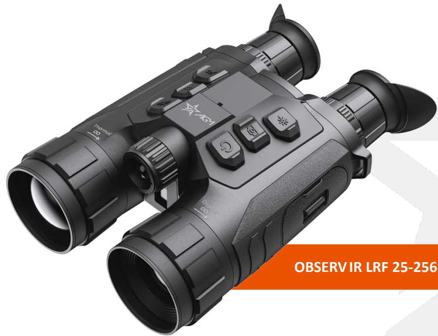
OBSERVIR LRF 25-256