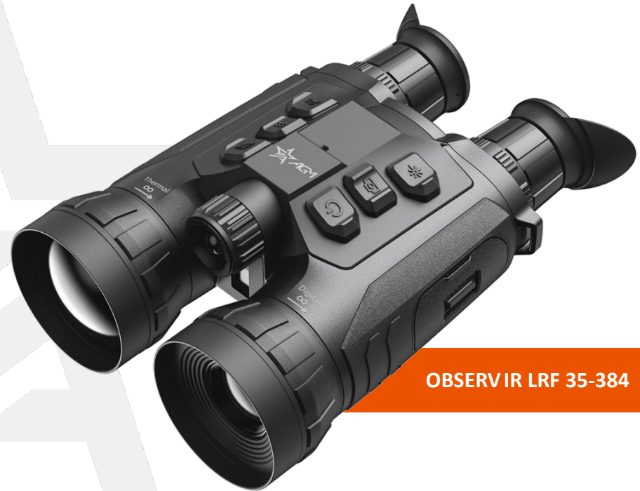
OBSERVIR LRF 35-384